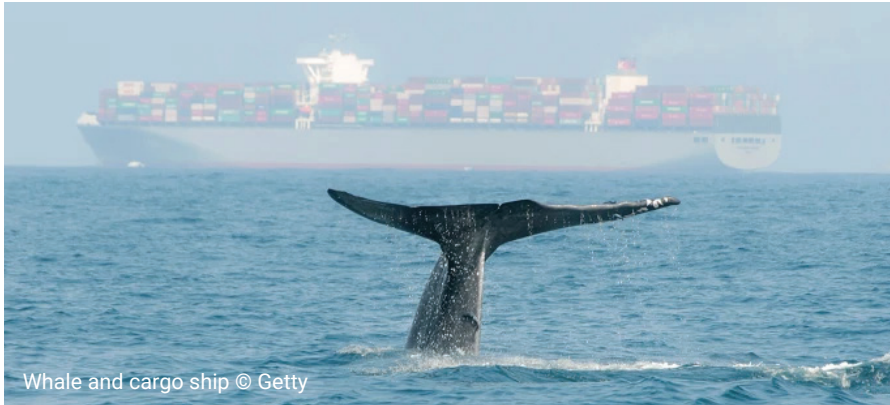
Whale and cargo ship

Marine mammals use sound for communication, navigation , and hunting. Human activities like shipping, fishing, oil and gas exploration and marine military activities, marine renewable energy production, and recreational water activities produce noise and can disrupt marine mammals. These disturbances can interfere with the animals' natural behaviours, like feeding, caring for their young, socialising, resting, and migrating . As a result, individual fitness and survival rates may decrease.